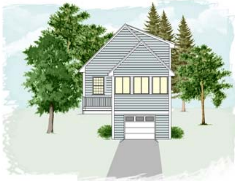
"THE CENTER HARBOR"